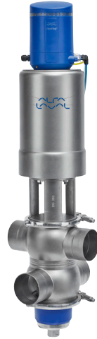
Mixproof valve with ThinkTop® V70